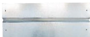
2x Nr. A